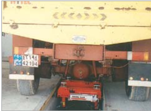
P300 hand pump and 10 ton cylinders used for a vehicle lift.